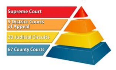
Florida State Courts System

In addition to state courts, a lawsuit may be brought in the federal court system in cases involving or arising under federal law or for large claims involving citizens of different states. Federal district courts are the trial courts in the federal system, and federal circuit courts are the federal courts of appeal. For more information, refer to Title V, Florida Statutes .